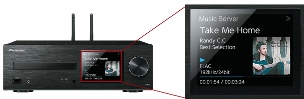
LCD Display with Song Information

* Album artwork may not be available depending on file type