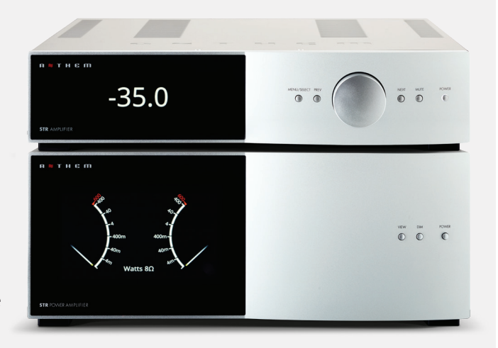
STR Preamplifier pictured with STR Power Amplifier (sold separately). Both models available in black or silver finishes.