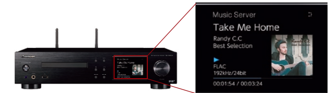
LCD Display with Song Information

* Album artwork may not be available depending on file type