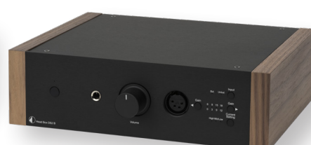
black with walnut wood side panels