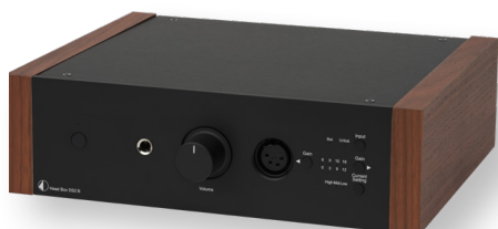
black with rosewood side panels