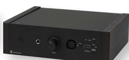
black with eucalyptus wood side panels