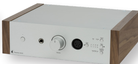
silver with walnut wood side panels