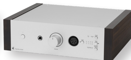
silver with eucalyptus wood side panels