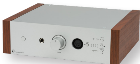
silver with rosewood side panels

sound and a near dead silent noise floor. Both outputs on the front can be used simultaneously for shared listening experiences. The Head Box DS2 B is able to adjust to every headphone in your collection: hard to drive dynamics, current hungry planarmagnetics and sensitive in ear monitors! Pure pleasure out of one box.