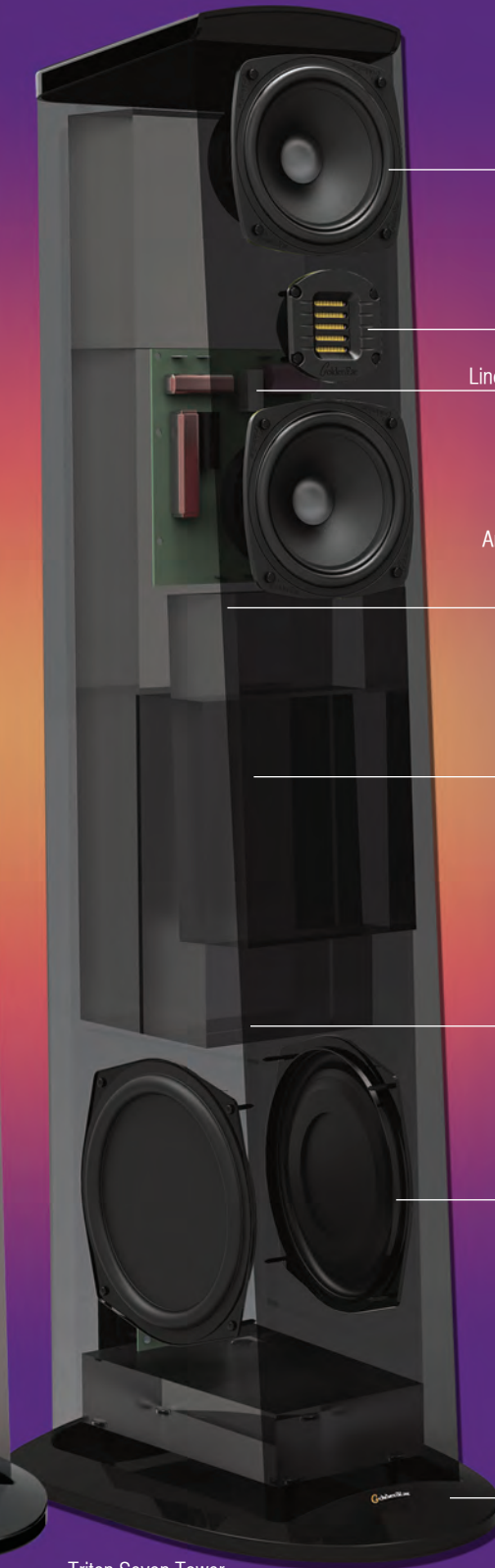
Triton Seven Tower

Accelerometer Optimized Non-Resonant Cabinet