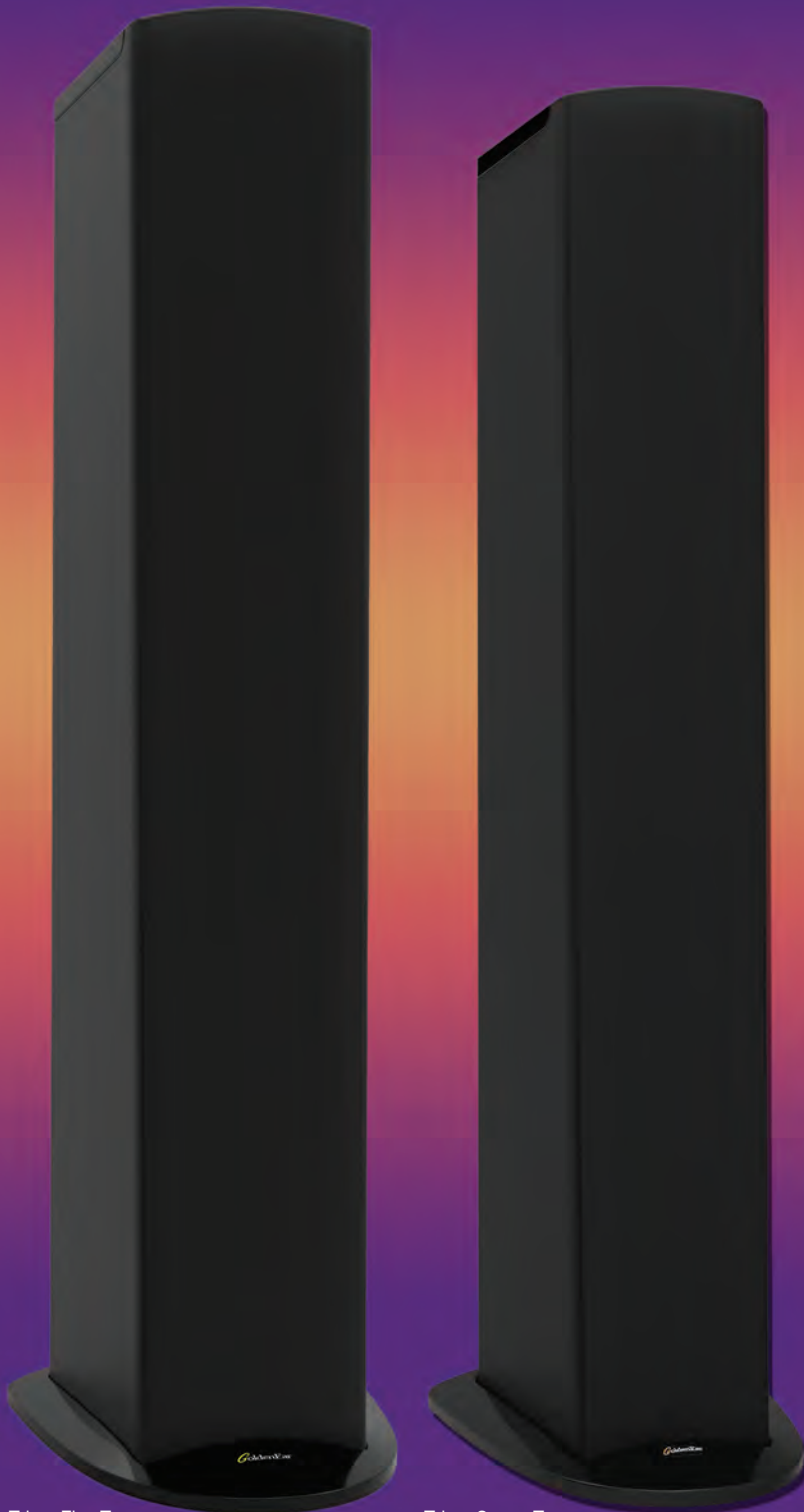
Triton Five Tower