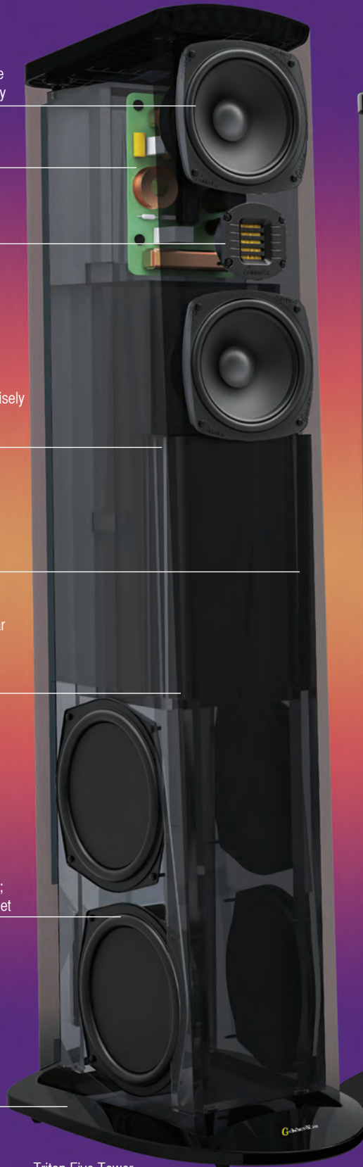
Triton Five Tower

Accelerometer Optimized Non-Resonant Cabinet