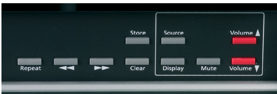
Additional panel controls are accessed via the front left flap next to the main controls.

Robert Harley, editor of The Absolute Sound , reported: "CDs played through the 808.2 and the new DSP7200 active DSP loudspeaker sounded like high-resolution recordings". Why not listen for yourself?