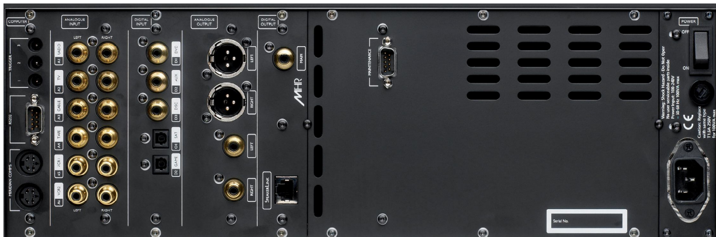
808.2 rear panel – the 808.2i is shown, with analogue and digital inputs